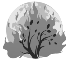
The Burning Bush Ex 3:1-12

25 NOW LARGE CROWDS WERE TRAVELING WITH [JESUS;] and he turned and said to them, 26 “Whoever comes to me and does not hate father and mother, wife and children, brothers and sisters, yes, and even life itself, cannot be my disciple. 27 Whoever does not carry the cross and follow me cannot be my disciple. 28 For which of you, intending to build a tower, does not first sit down and estimate the cost, to see whether he has enough to complete it? 29 Otherwise, when he has laid a foundation and is not able to finish, all who see it will begin to ridicule him, 30 saying, ‘This fellow began to build and was not able to finish.’ 31 Or what king, going out to wage war against another king, will not sit down first and consider whether he is able with ten thousand to oppose the one who comes against him with twenty thousand? 32 If he cannot, then, while the other is still far away, he sends a delegation and asks for the terms of peace. 33 So therefore, none of you can become my disciple if you do not give up all your possessions.”