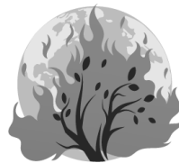
The Burning Bush Ex 3:1-12

10 “Whoever is faithful in a very little is faithful also in much; and whoever is dishonest in a very little is dishonest also in much. 11 If then you have not been faithful with the dishonest wealth, who will entrust to you the true riches? 12 And if you have not been faithful with what belongs to another, who will give you what is your own? 13 No slave can serve two masters; for a slave will either hate the one and love the other, or be devoted to the one and despise the other. You cannot serve God and wealth.”