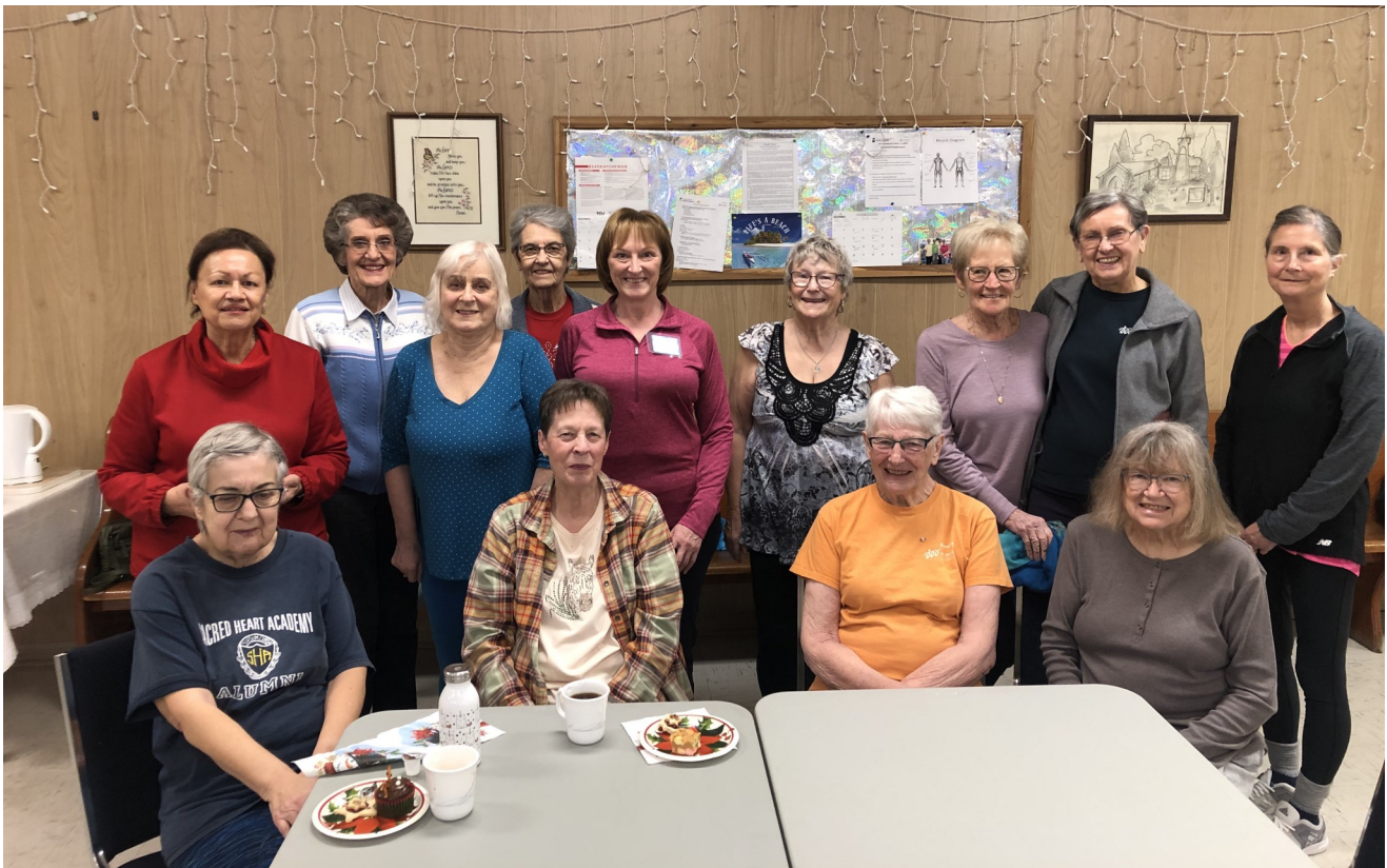
Christmas Gathering December 12th