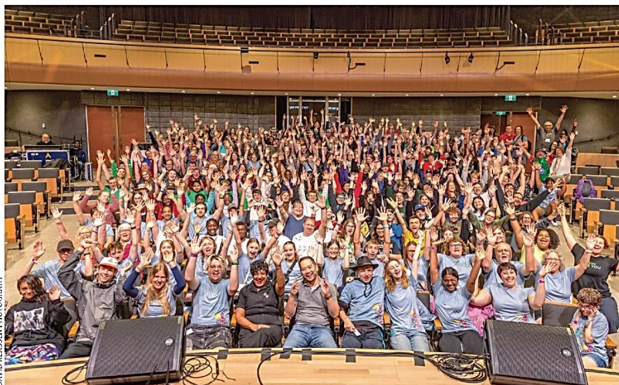
The entire CLAY gathering poses for a group shot.

BETWEEN THE LARGE GROUP GATHERINGS, PRAISE AND WORSHIP SESSIONS, REFLECTIVE GROUP EXPERIENCES AND PERSONAL PRAYER TIME, THE TRIP OUT TO WATERLOO, ONT. WAS FILLED WITH EXPERIENCES THAT WILL SURELY LAST A LIFETIME.