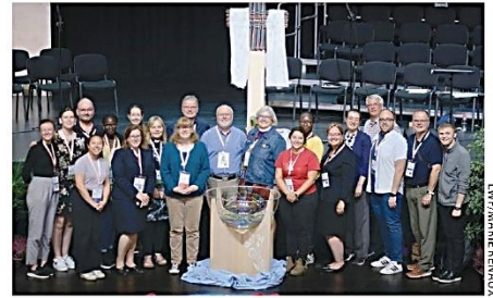
ELCIC members contributed in a variety of ways at the 13th Assembly of The Lutheran World Federation, in Krakow, Poland, September 2023.