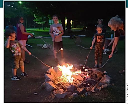
Sharing a campfire at Camp Lutherlyn.